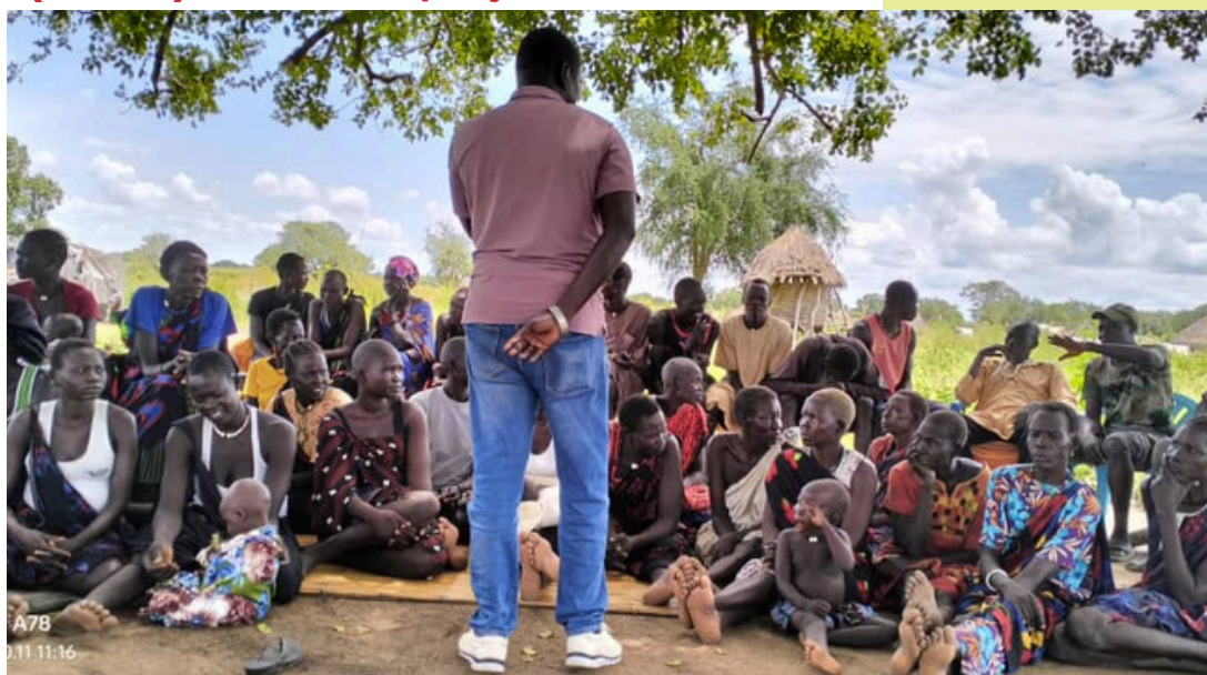
During awareness Campaign on unpaid care and Lost Productivities/Income by Men & Women in four Bomas of Terekeka County of Central Equatoria State.

Community Empowerment for Progress Organization (CEPO) and its partners have launched a project called Investing in Women in South Sudan with kind support from African Challenge Fund (ACF) aims to economically empower women in the agricultural sector through selected value chains.