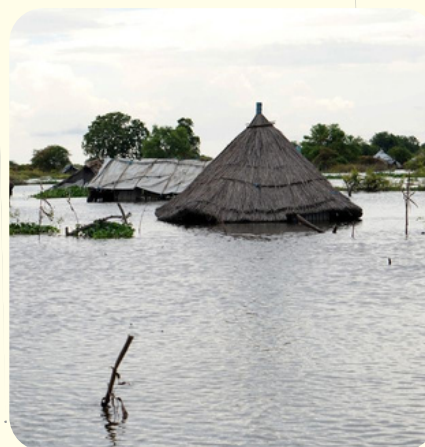
survey map on page 7

South Sudan population figures that are to be used for flood preparedness and responses should be properly aggregated with specific focus on figures of persons with disabilities. Data is very important for any accurate and functional planning or strategy designing in any form of shocks preparedness and responses. The survey realized that the absence of accurate data on persons with disabilities has contributed to missing of public messaging on disability inclusion in the whole South Sudan Flood Preparedness and Response Plan for June-December 2024 besides the stronger call made in article 11 (1) of the United Nations Convention on the Rights of the Persons with Disabilities as quoted